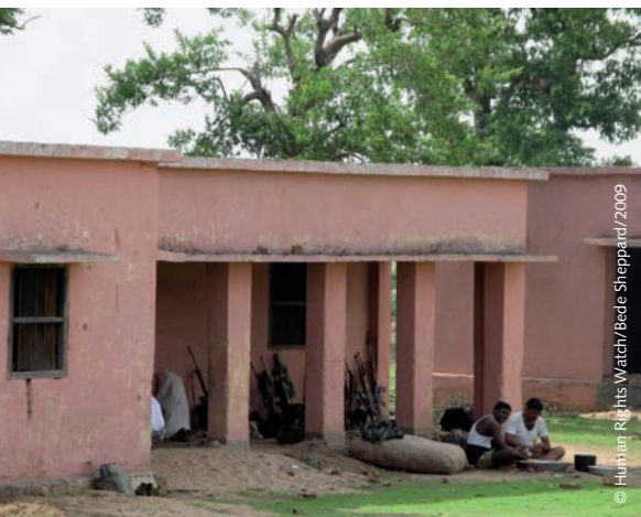
Security forces line their weapons against the school wall at Dwarika Middle School, India, on June 7, 2009.

For instance, it includes the closure of schools or their takeover for military or security operations by state armed forces or armed police, or by rebel forces, occupying troops or any armed, military, ethnic, political, religious, criminal or sectarian group.