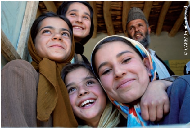
In a rural community in Afghanistan, these children were able to attend a school after the Taliban left. The school was built inside the home of the man in the top right corner of the image.

adequate protection and recovery measures are put in place.