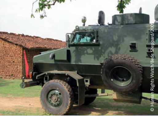
When security forces arrived to camp at Dwarika Middle School, India, on June 7, 2009, they turned up in an armoured troop carrier.

killed remained constant, at 28 in both 2007 and 2008. 19