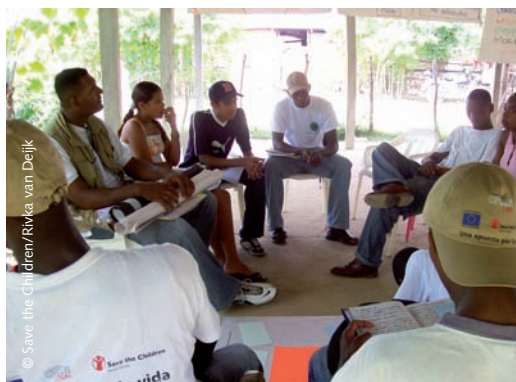
In 2007, a group of youth workers were trained by Save the Children in child protection and children's rights in Cartagena, Colombia, to facilitate workshops aimed to help young people avoid recruitment into armed forces. Many young Colombians face forced recruitment by illegal armed groups.

The use of dedicated armed protection has had mixed results against attacks on education. Measures that can be taken include: a general increase in force levels in the area, security patrols around schools, the posting of police or armed security guards at