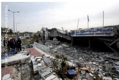
The American International School in the city of Beit Lahia in northern Gaza, Palestinian Autonomous Territories, was completely destroyed during Operation Cast Lead. More than 170 schools in Gaza were damaged or destroyed during the hostilities.

A reported 250 students and 15 teachers were killed and hundreds more were injured in military strikes. Some students were injured by shattered glass while taking examinations; others were killed while waiting for the bus home.