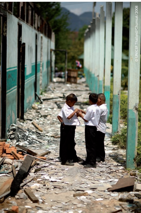
Thai students stand in the doorway of a burned-out school in the southern border province of Yala. Since the resurgence violence in early 2004, hundreds of schools have been severely damaged or destroyed in the three southernmost provinces of Thailand.

between the Thai government and the people in the south”. 84 Such policies were later lifted, but the government has tended to concentrate on security operations rather than acknowledging the socio-cultural roots of the conflict. “Military operations therefore are always the backbone of government policies,” Daoh argues. 85