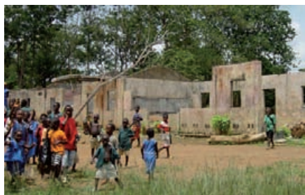
Koindu's primary school was completely destroyed during Sierra Leone's 11-year civil war. Rebel soldiers used it as a base and training ground - and they used its books and wooden furnishings as fuel for fires. Virtually nothing was left after the war but shells of roofless buildings.

The occupation of school and university buildings by armed groups or security forces, or their use as a military base, constitutes an attack on education