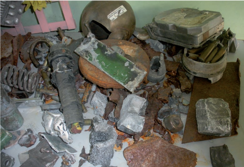
The headmaster of Shegaia boys' secondary school, located in the 'buffer zone' of Gaza, near the Israeli border, found all these weapons over the years. The school has been damaged four times since it was opened in 2004.