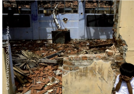
A boy covers his face after returning to his damaged school in Batticaloa District, Eastern Province, Sri Lanka, in 2007. The school was evacuated when the Sri Lankan Government and the Liberation Tigers of Tamil Eelam (LTTE) forces, a separatist guerrilla group, exchanged fire in the area.

Attacks on aid workers can lead to the removal of aid workers from a given area or even the country, with the loss of expertise and supplies that came with them.