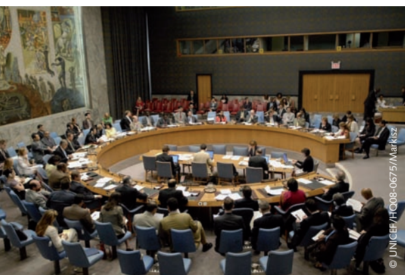
The UN Security Council Working Group on Children and Armed Conflict convenes at UN Headquarters in New York to discuss violations against children during armed conflict.

Under SC Resolution 1612, a Working Group of the Security Council was set up,