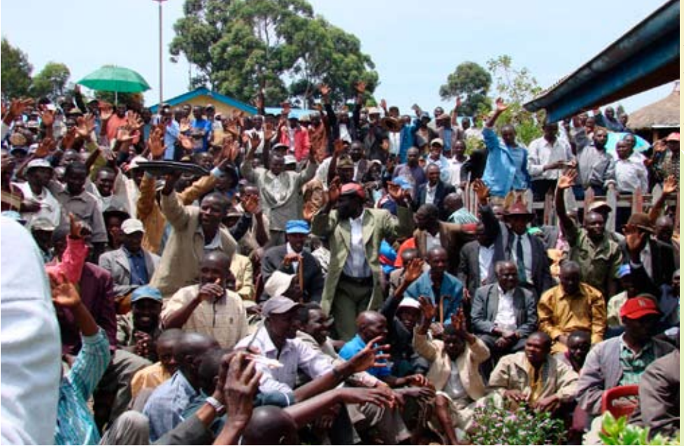
Farmers voice their support for pro-smallholder policy in Kenya.

become more empowered and more capable of representing the interests of their members in key policy arenas.