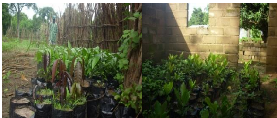
Village Nurseries at Community level

In addition to the above, replacement has been made to the missing fence posts burnt by bush fire and the following communities have received and erected their fence posts (400) each: Gumaloya, Biram Gidoya in Upper Badibu, Kolly-kunda, Wayaworr and Ndurren in Central Badibu and in Lower Nuimi Mbulum and Mannen. Polythene bags numbering 822 was purchased and distributed amongst the 10 communities to raise seedlings for planting.