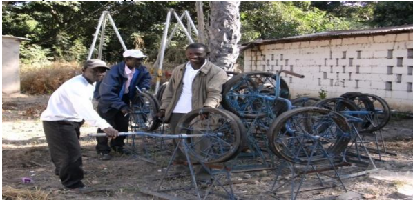
Project Manager & Two Technical Advisors