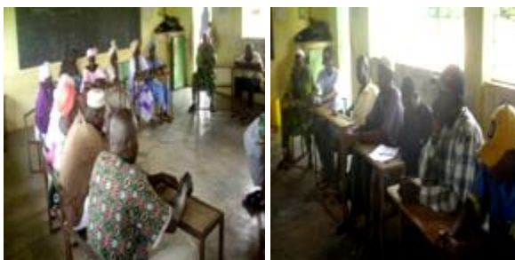
Training of village executive members on group and effective environmental management