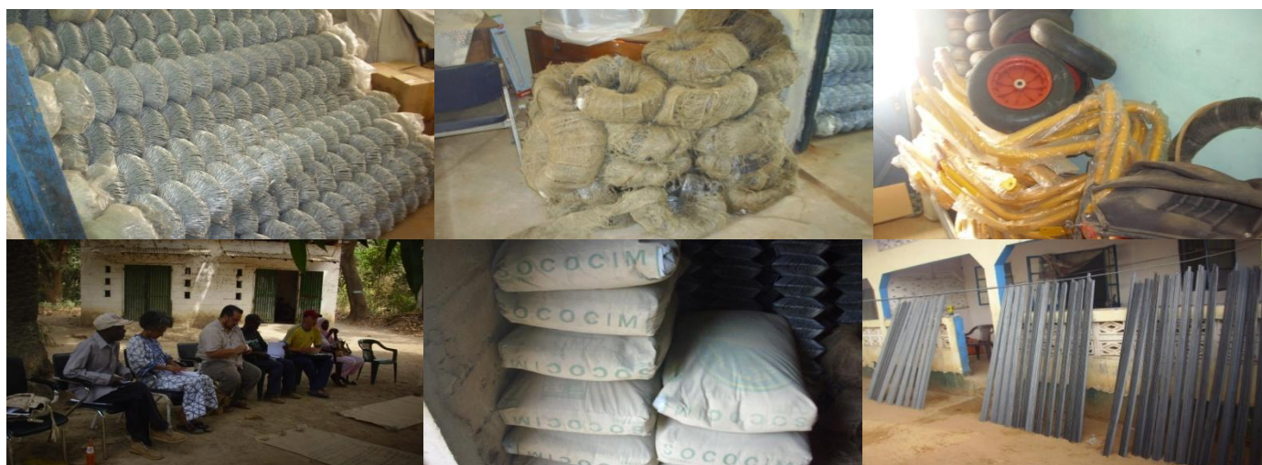
Training activities and materials provided as part of the project

It is too soon to measure the impact of this project. However, the Project monitoring team has instituted procedures for implementing agencies to adopt that will facilitate impact evaluation in future. Implementing agencies are therefore required to safeguard all documentation related to project implementation for a period of five years, or risk refunding grants received under the project.