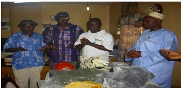
Presentation of disaster materials by MMAP staff to The Governor of NBR Kerewan

Disaster Risk Reduction (DRR) is a project executed in collaboration with Concern Universal. MMAP oversees North Bank Region West to implement disaster mitigation initiatives. The project addresses communities affected by either floods or wind storm by giving out relief assistance such as cement, corrugated iron sheets, rice, kettles, soap, buckets and chlorine tablets to disinfect open wells. Training in disaster management is also provided by MMAP in collaboration with the medical teams in the beginning of the rainy season. MMAP also provide protective gears such as rain coats, boots, helmets and gloves to the regional disaster management team in Kerewan