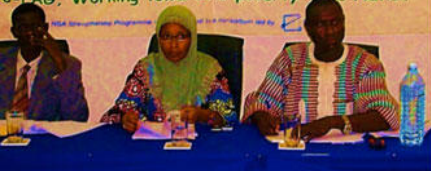
Pro-PAG Annual General Meeting at the TANGO premises October 2011.

Pro-PAG, Working towards a poverty-free Nation