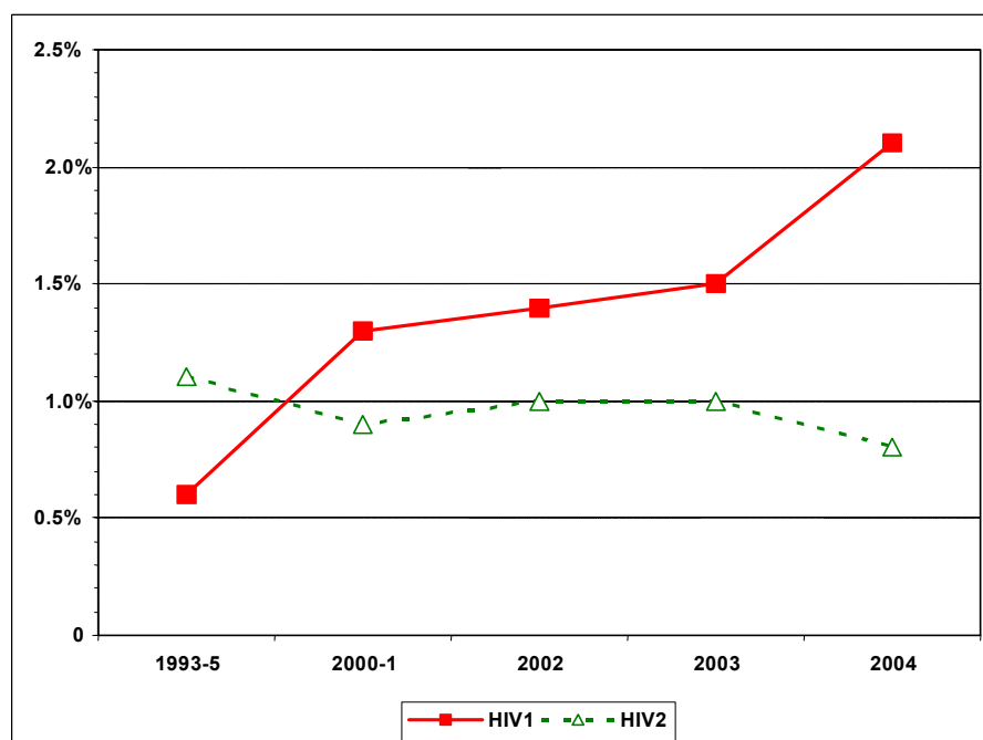
Figure 1: HIV/AIDS trends